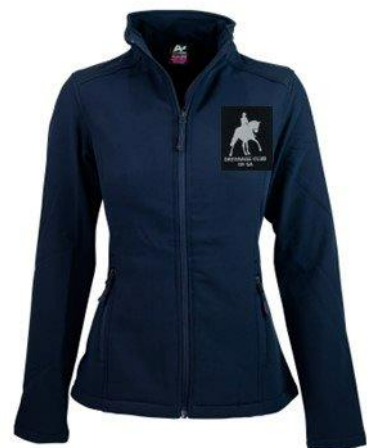
SELWYN SOFT SHELL JACKET $63

No order is too small – please contact us for a sizing chart & orders via dcsa2022@gmail.com or Facebook messenger