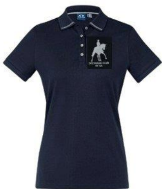
ASTON POLO $38

* Add large embroidered logo to back of garment for $20 each