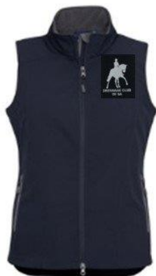
GENEVA VEST $67